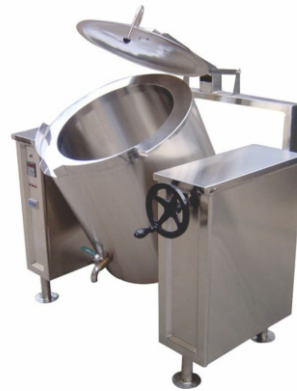
TILTING BOILER PAN