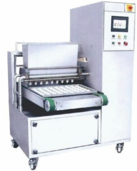
COOKIES DROPPING MACHINE