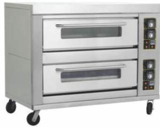
DOUBLE DECK OVEN