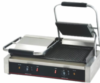
SANDWICH GRILLER DOUBLE