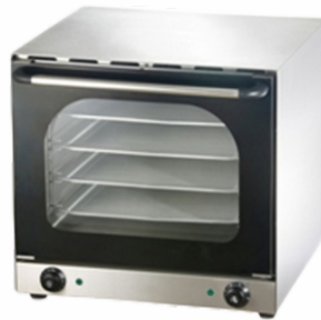
ELECTRIC CONVECTION OVEN