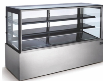
STRAIGHT GLASS DISPLAY