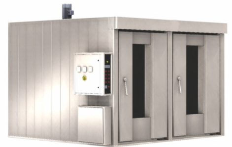
DOUBLE TRAY PROOFER