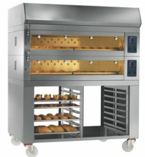
DECK + TRAY OVEN