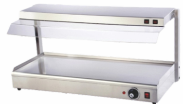
FOOD WARMER BIG