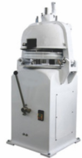
DOUGH DIVIDER ROUNDER