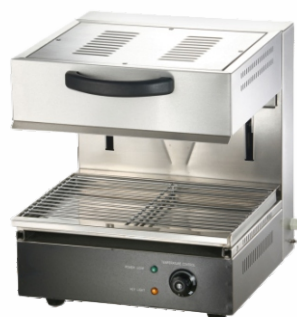
ELECTRIC SALAMANDER TOP SLIDING