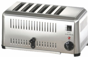
TOASTER 6 SLOT