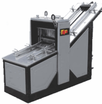
HIGH SPEED BREAD SLICER