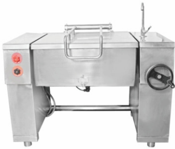
TILTING BRAZING PAN