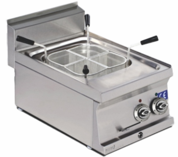
ELECTRIC PASTA COOKER