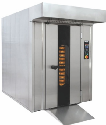
SINGLE TROLLEY ROTARY OVEN