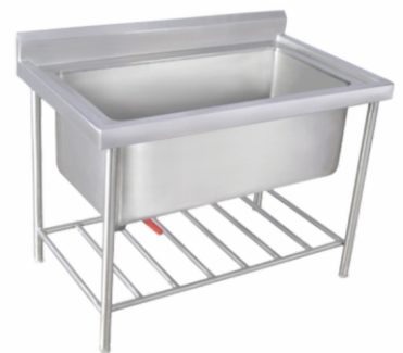
POT WASH SINK