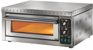
SINGLE DECK OVEN