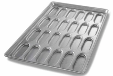
BUN & ROLL PAN