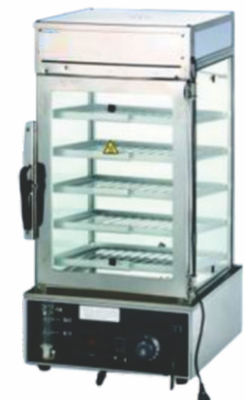
FOOD STEAMER SHOWCASE