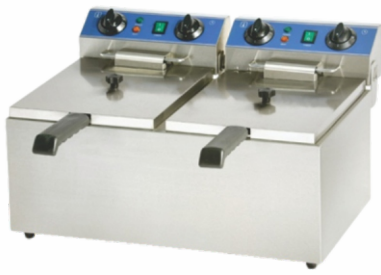
DEEP FAT FRYER DOUBLE