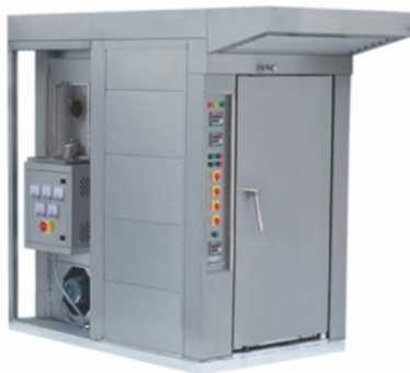
SINGLE TRAY PROOFER