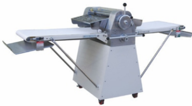
DOUGH SHEETER MACHINE