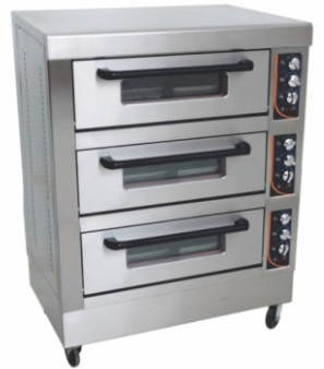
THREE DECK OVEN