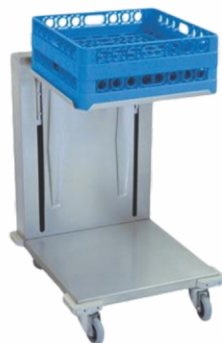
BASKET STACKING TROLLEY