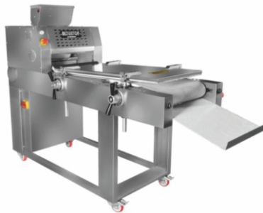
DOUGH MOULDER MACHINE