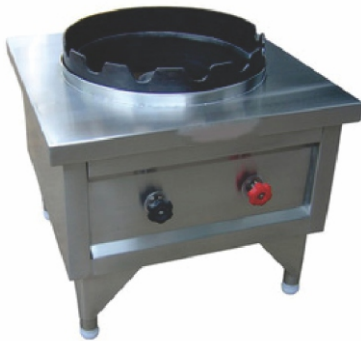
KADHAI GAS RANGE