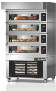
MULTI DECK OVEN