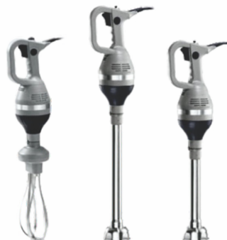
HAND HELD MIXER