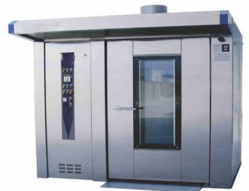
DOUBLE TROLLEY ROTARY OVEN