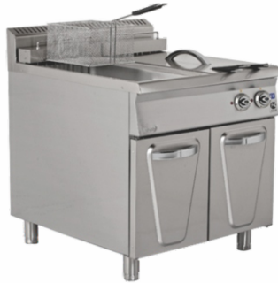
FRYER DOUBLE GAS ELECTRIC 5