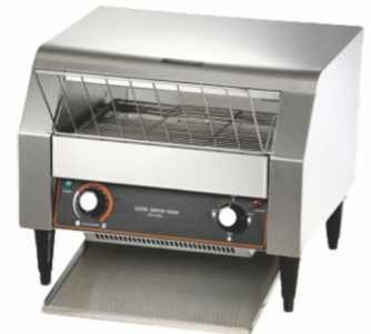
ELECTRIC CONVEYOR TOASTER