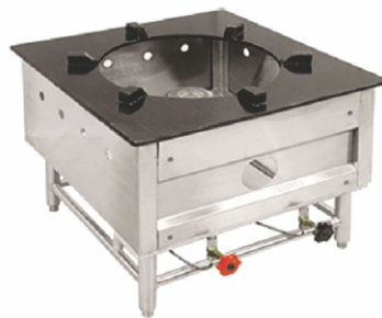
HEAVY DUTY GAS RANGE