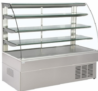
BEND GLASS DISPLAY